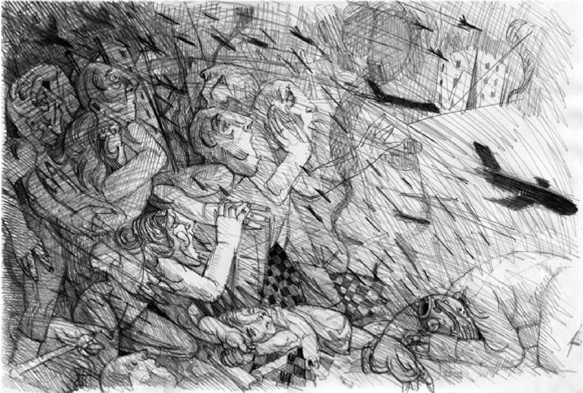
BOMBS Pencil on paper. From Disasters of War series, London 2009.