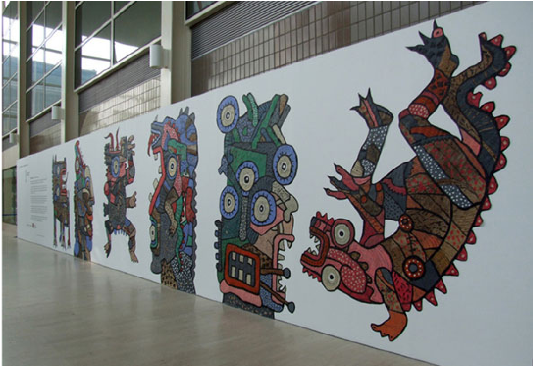
CONSTRUCTED MYTHOLOGIES. Mural, acrylic on paper-cuts. Milton Keynes 2008