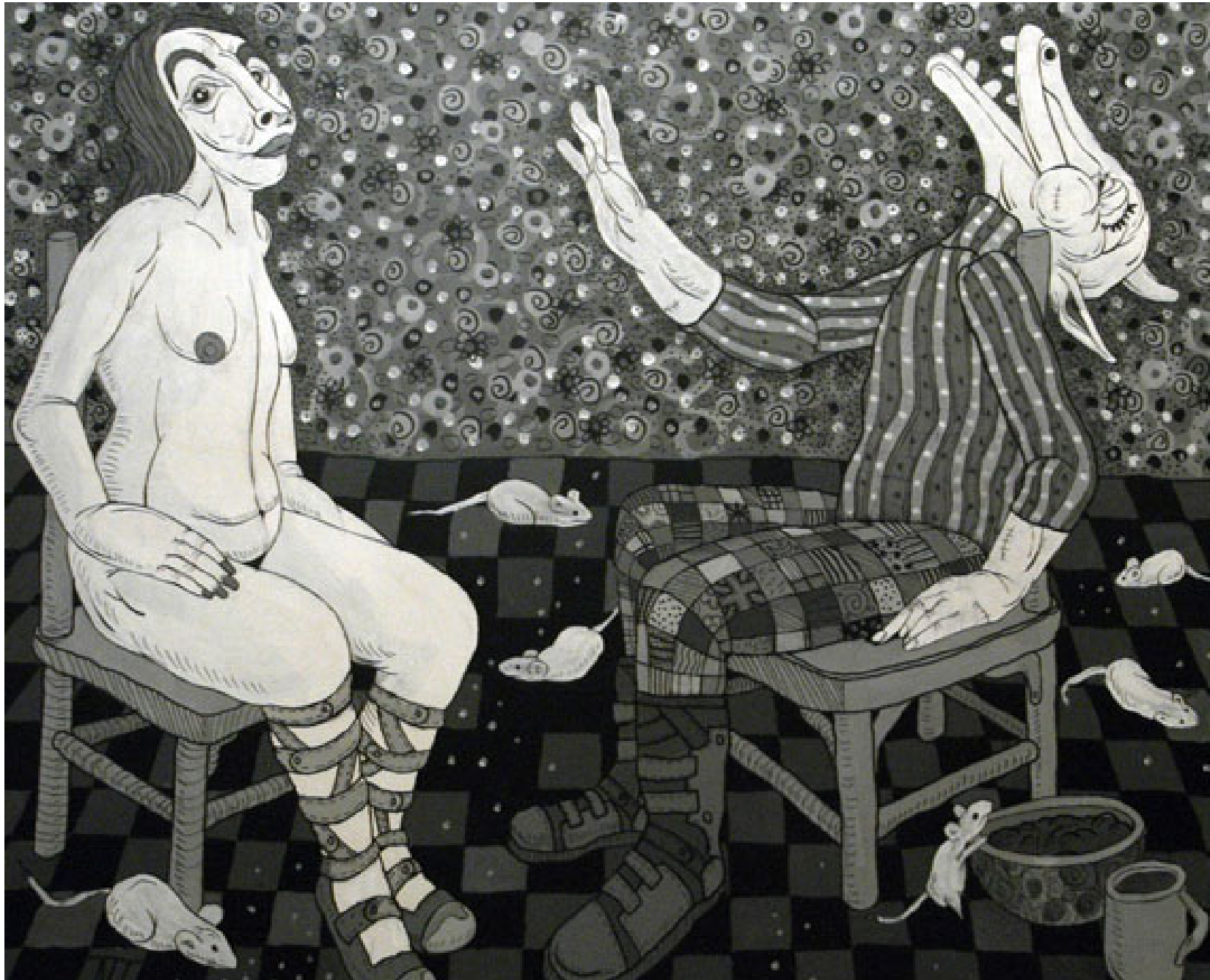
From Metamorphoses series, acrylic on wood, 122 cm x 150 cm. London 2008.