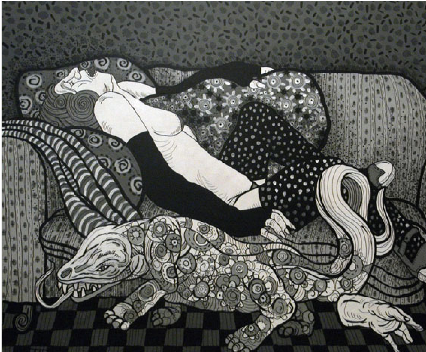
From Metamorphoses series, acrylic on wood, 122 cm x 150 cm, London 2008.