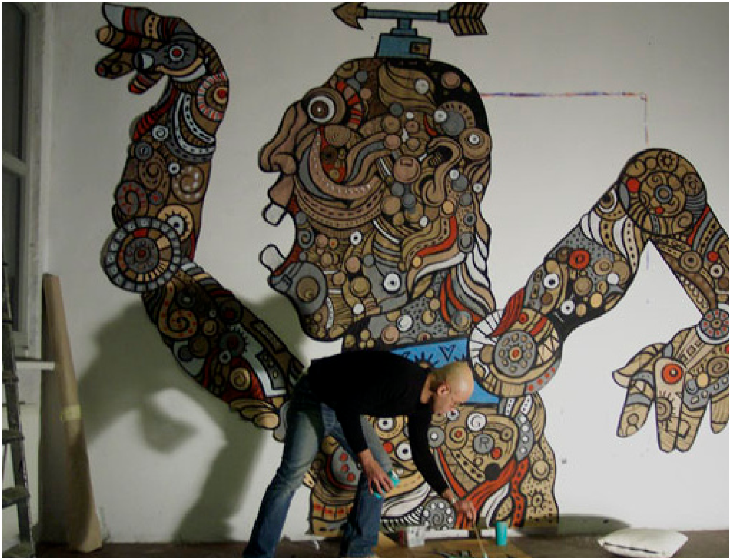
SCREAM. Mural, acrylic on paper-cuts. Work in process, Berlin 2005.