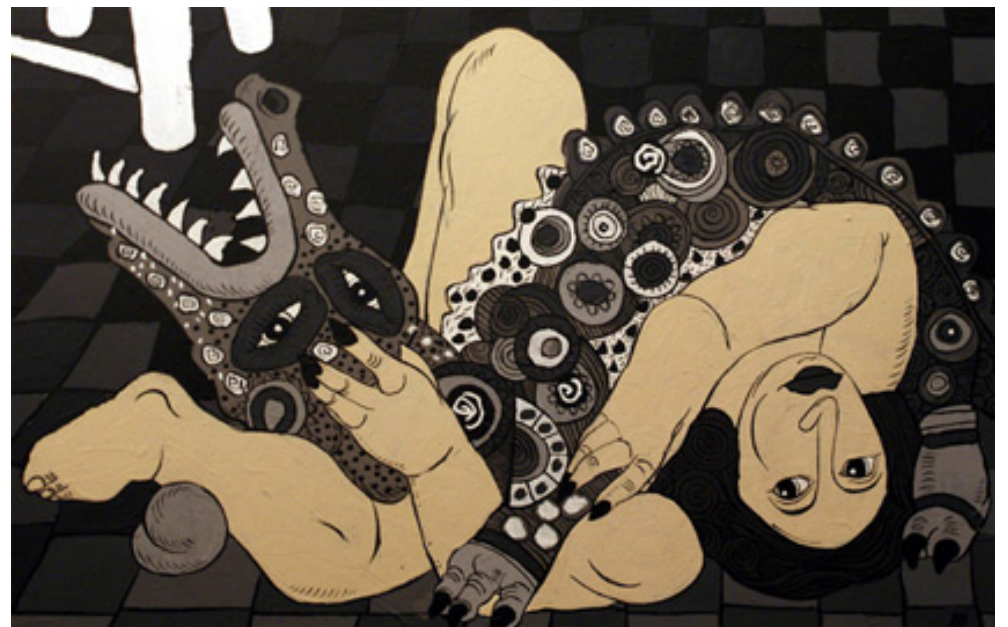
from SCARY TALES painting series, acrylic on wood 60 x 40 cm each. London 2008.