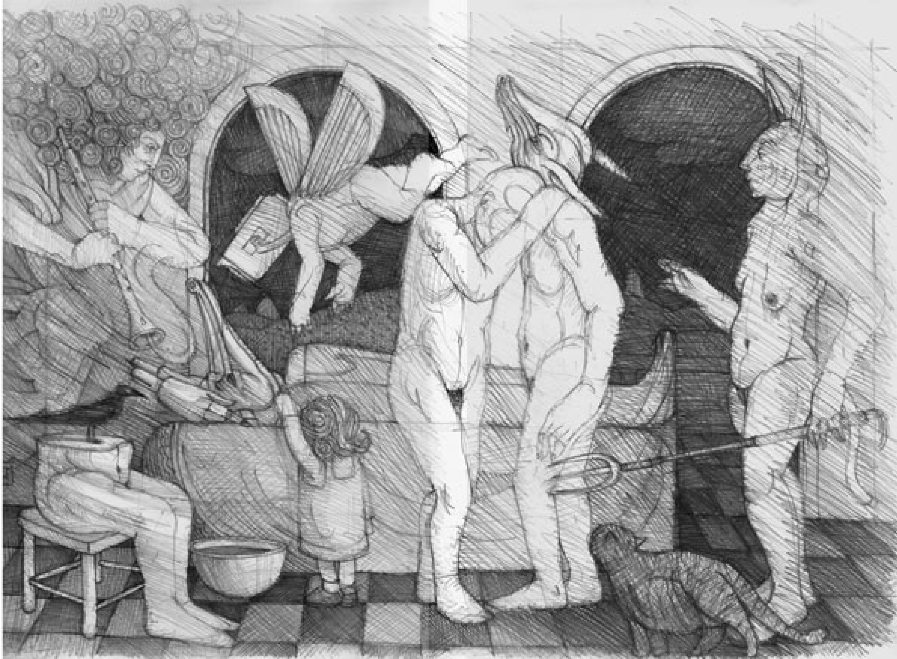
MY FUNERAL. Pencil on paper. From Private Nightmares series, London 2008.