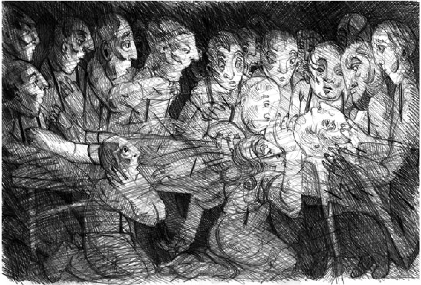
THEY BROUGHT HIM HOME. Pencil on paper. From Disasters of War series, London 2009.